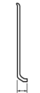
Butt Toe Base 5/8" Butts to 1/8" Floor Coverings