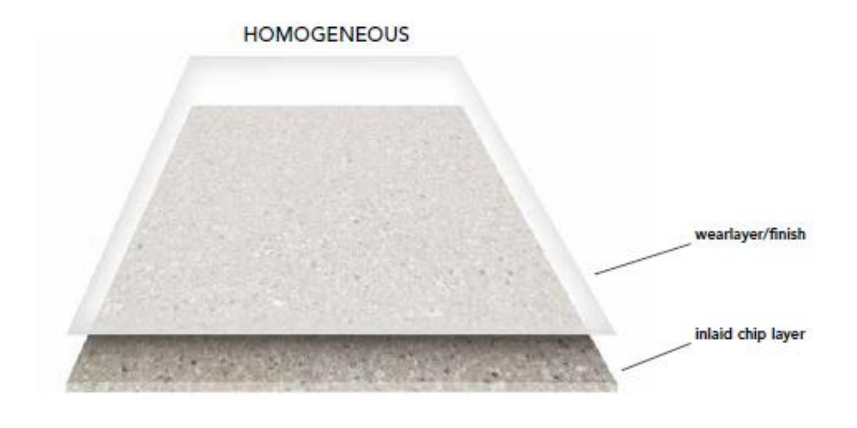
Figure 1: Diagram of homogeneous vinyl flooring cross section

The manufacturing process results in a single layer product although a decorative application and high-performance coating can be applied to the surface. A diagram of a homogenous vinyl flooring cross-section is shown in Figure 1.